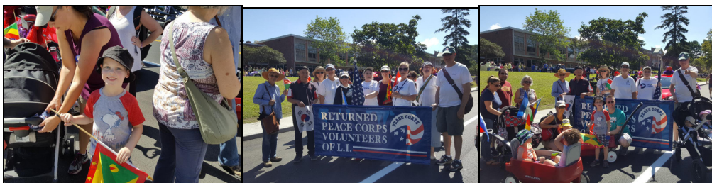
Photos from previous parade

The staging area is at the Laurel Avenue--William Brosnan School; signs there will direct you to the gathering spot for our group; plan to be there by 11:15 a.m. Leave yourself time to park since there are some street closures. Directions will be included in the reminder e-mail